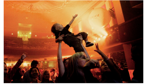
Kids Party at Rialto