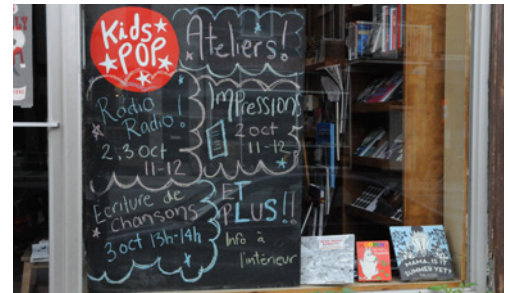
Workshops at Drawn & Quarterly